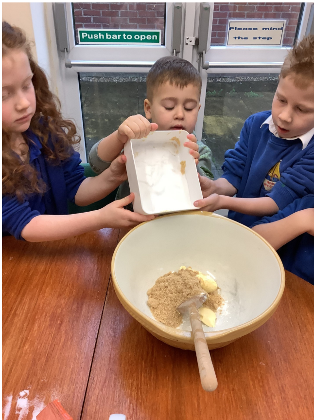
Following a recipe.